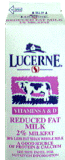
8 oz glass

Have ONLY these 3 items and get 133% of the recommended daily amount!!